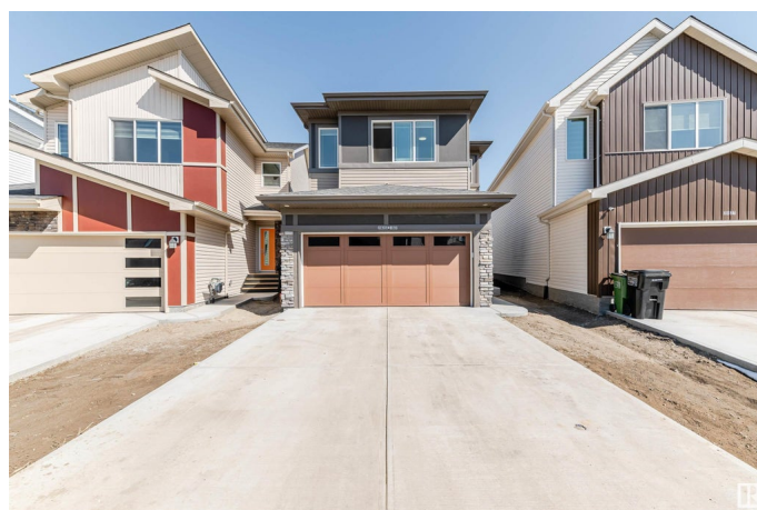
2023 157 St SW, Edmonton, AB

Main Floor Exterior Area 1046.51 sq ft Interior Area 973.00 sq ft Excluded Area 428.21 sq ft